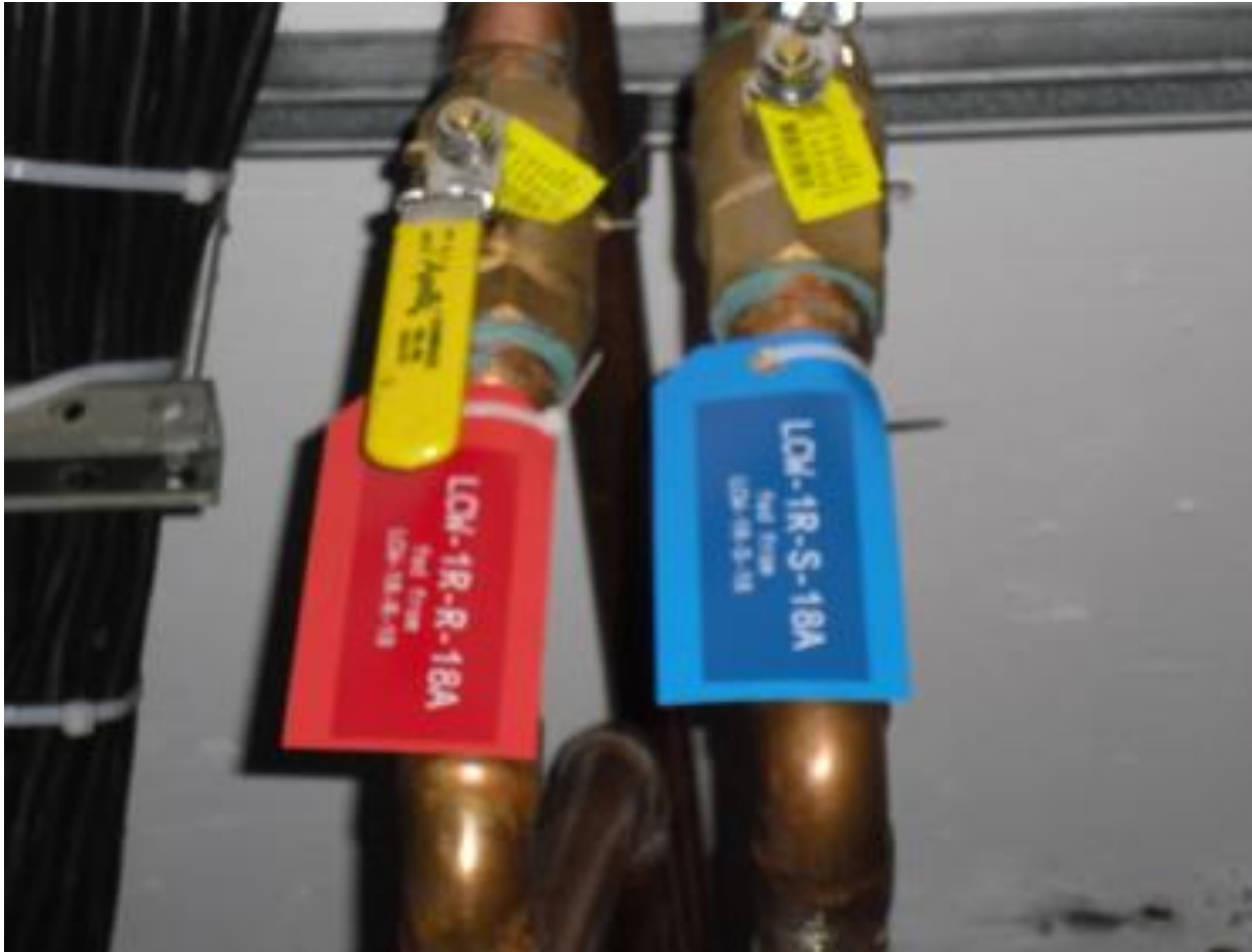
LCW valve tags