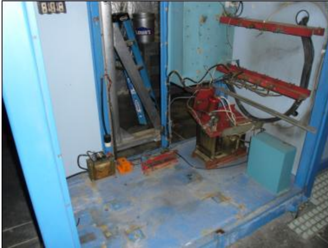
R100 CPS upgrade status