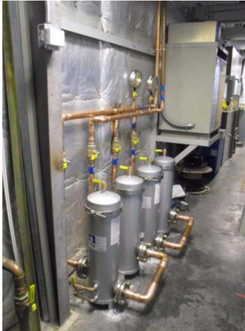
Septa LCW filtering improvements